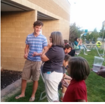
Uintah Students Present Research