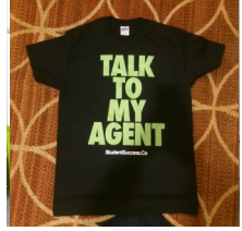
SSA Program Gets Underway