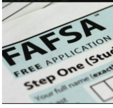
FAFSA and College Application Help Available