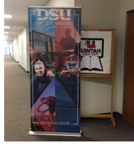
College Reps Visit Uintah High